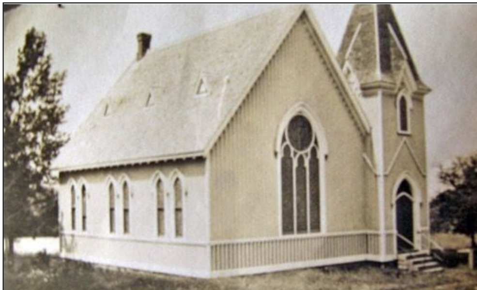
An article on St. James is online at: http://keillorhousemuseum.com/museums/st-james-textile-museum/st-james-presbyterian-church-a-brief-history

The order of service and documents regarding the amalgamation were obtained this summer and are set to be deposited into the Mount Allison University Archives.